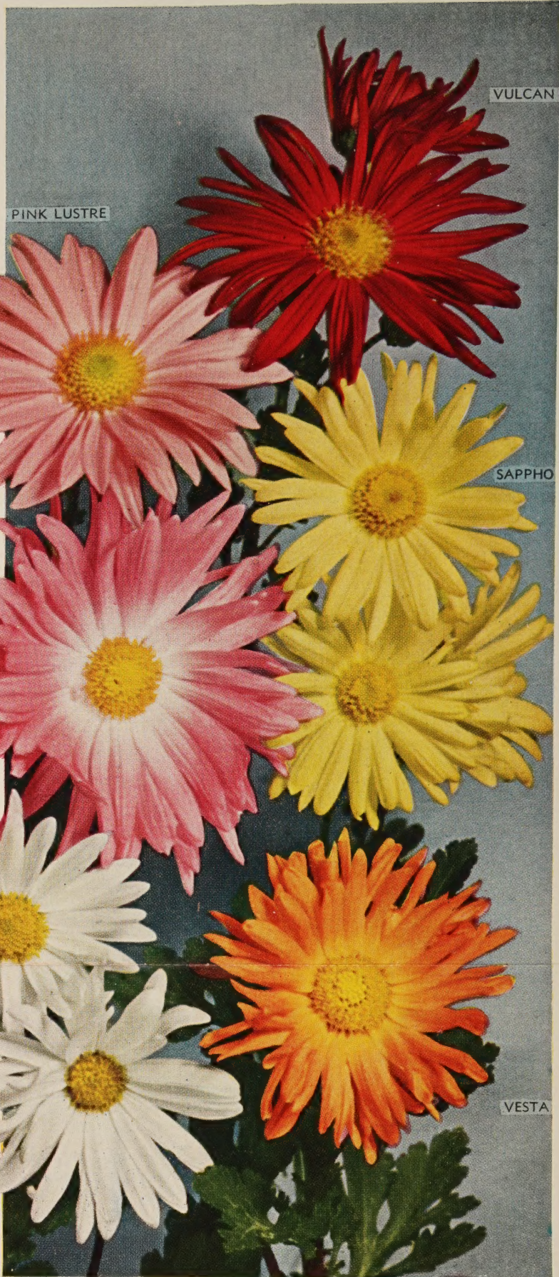
Korean Hybrid Chrysanthemums

DATES FOR 1942 TULIP TIME FESTIVAL AT HOLLAND, MICHIGAN May 16-24 On our Tulip display fields will be shown over five hundred distinct varieties of Tulips, including many of the rarest in existence, and our latest seedlings. Our new bulb catalog will be mailed to our customers early in May.